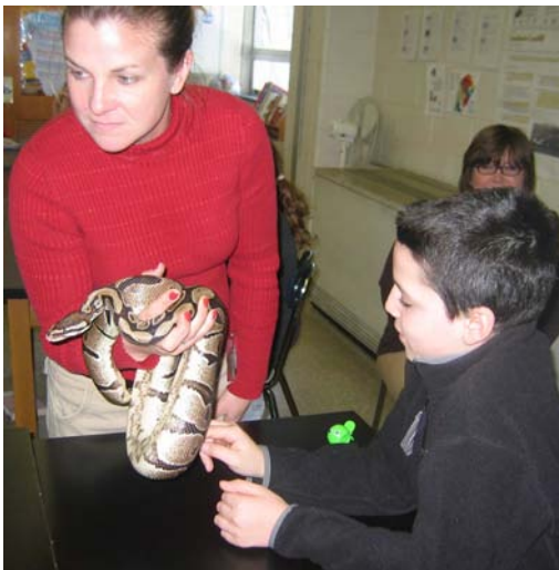
A 6 th grader touches a live ball python during the Adaptations outreach program

Students promote environmental awareness to their fellow students through a battery recycling program (last year, student and teachers recycled over 400 batteries), and through maintenance of the interior courtyard habitat, re-designed and improved by last year's Club members. The courtyard features bird feeders and bird nest boxes, native trees and plants, and a pond with fish and wetland plants.