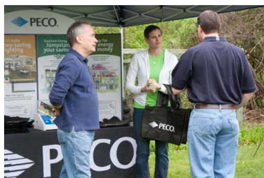
PECO, an Exelon company, provides important support for community events like EnviroFest and other projects throughout our region.