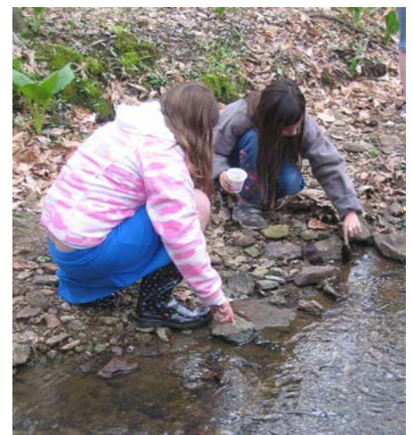
Girl Scouts perform a water study at GVA during a Water Wonders Badge workshop.

Our next Badge Day at GVA is Saturday, May 1 st . Brownie troops will work on their "Water Everywhere" Try-It from 10:00 – 11:30 a.m.; and Juniors will work on their "Water Wonders" Badge from 12:00 – 1:30 p.m. Fees are $7 per Scout and advanced registration and payment are required 7 days prior to program.