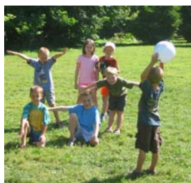
Enjoying a game at GVA's Summer Nature Day Camp 2009.

As the long, cold winter comes to an end it's time to think about the warmth of the summer – and another year of outdoor fun and learning at Summer Nature Day Camps! Our nature camps are designed to engage children in fun and educational outdoor activities in order to foster a better appreciation for the natural world. Themed, weekly camp activities include nature walks, guest presentations, educational games, craft projects, and self-discovery through nature play and exploration of the 197-acres of forest, meadows, and water habitats that Welkinweir has to offer. New programming has been added for this year, including new overnight programming for 9-11 year olds, additional camps for 12-14 year olds, Nature Play Family Camp for 4 & 5 year olds and their adults, and an End-of-the-Summer Family Campout.