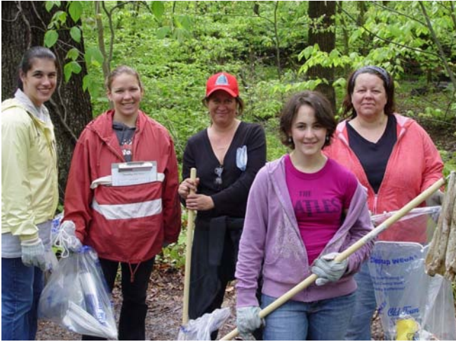
Volunteers will join with GVA on May 1 to clean up the streams in northern Chester County.

Since 1997 GVA lead volunteers have gathered annually for StreamDay Cleanup to rid our streams of the refuse that has made its way into and along these streams.