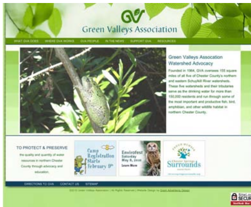
The new homepage at greenvalleys.org .

The Scouts will create and exhibit a display at the Green Valleys Association's EnviroFest on May 8 th to Show 'n' Tell what they've accomplished and to hand out literature and resources that explain the importance of their work.