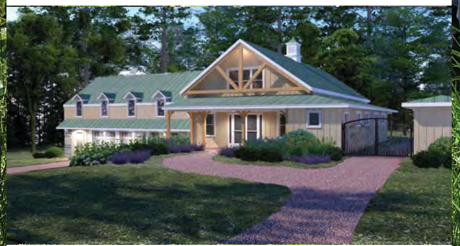
Conceptual design for future GVWA Environmental Education Center.

Portions of our 2017 Annual Appeal funds were used develop conceptual designs. This year's Appeal proceeds will go directly to creating the construction ready drawings we will need for the next phase.