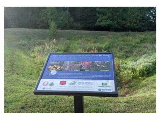
Bees, Birds and Butterflies!