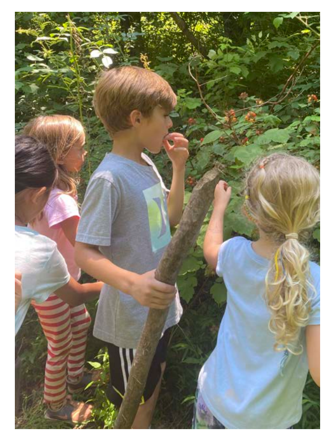
Controlling Invasive Wineberries

We had more guest presenters, and more field trips! There are so many opportunities to engage youth in the rich ecosystems of northern Chester County, and by bringing in specialists, or journeying to special places, we can access some of those opportunities. The presentations and off-site activities related to the theme of the week, much to the excitement of the campers and counselors.